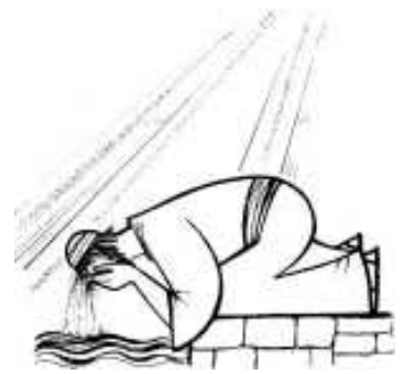
He went off and washed himself, and came away with his sight restored.