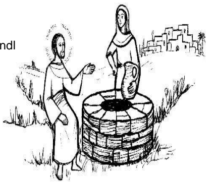
A spring of water welling up to eternal life