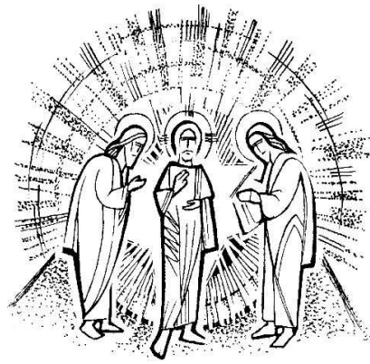
His face shone like the sun

March 22/23 3 rd Sunday of Lent HOSPITALITY USHERS READER SERVERS *EMHCS MUSIC MINISTRY COUNTERS