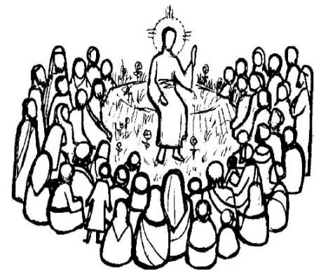
"You have learnt how it was said to your ancestors; but I say this to you."