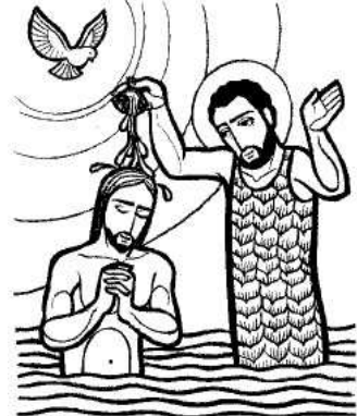
After Jesus was baptized he saw the Spirit of God descending like a dove.