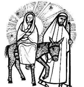
Take the child and his mother and escape into Egypt.