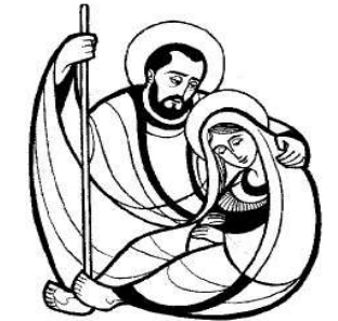
Jesus is born of Mary who was betrothed to Joseph, son of David.