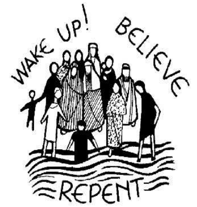
Stay awake, so that you may be ready!