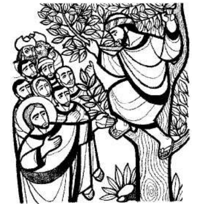
The Son of Man has come to seek out and save what was lost.