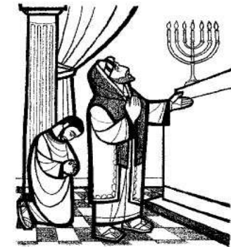
The publican went home at rights with God; the Pharisee did not.