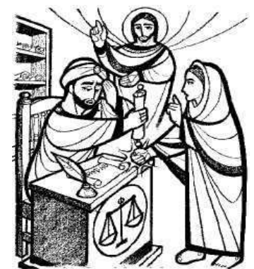
God will see justice done to His chosen who cry to him.