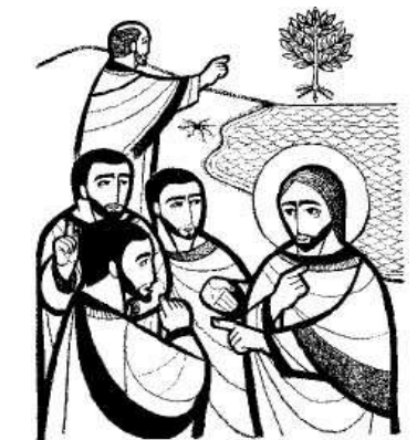
If only you had faith!