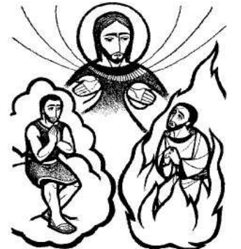
Now he is comforted here, whereas you are tormented