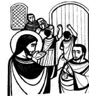
"Strive to enter by the narrow door; for many, I tell you, will seek to enter and will not be able."