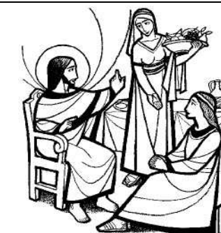
Martha served, Mary listened.