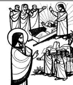
"Young man, I tell you to get up." God has visited his people.