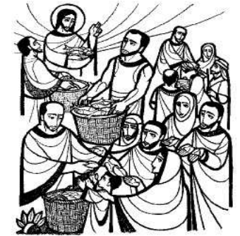
They all ate and were satisfied.