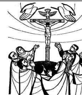
The Spirit of Truth will guide you.