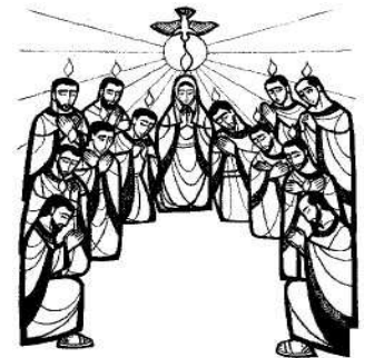
Receive the Holy Spirit.

May 25/26 The Most Holy Trinity HOSPITALITY USHERS READER SERVERS *EMHCS