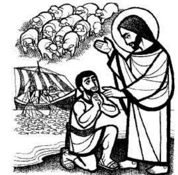
"Feed my sheep."