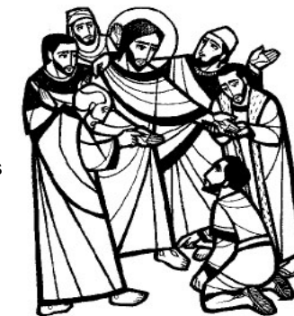
"Peace be with you."

April 13/14 3 rd Sunday of Easter HOSPITALITY USHERS READER SERVERS *EMHCS