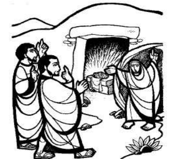
He saw and believed!

April 6/7 DIVINE MERCY SUNDAY HOSPITALITY USHERS READER SERVERS *EMHCS