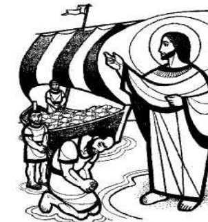
Simon Peter fell to his knees and said "Depart from me, Lord, for I am a sinful man."

February 13 Ash Wednesday HOSPITALITY USHERS READER SERVERS *EMHCS MUSIC