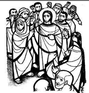
"Like Elijah and Elisha, Jesus is not sent to the Jews only."

February 9/10 5 th Sunday in Ordinary Time HOSPITALITY USHERS READER SERVERS *EMHCS