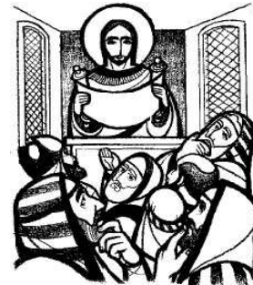
"Today this Scripture passage is fulfilled in our hearing."