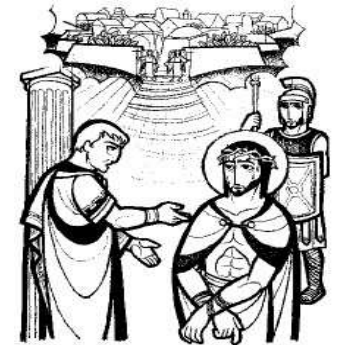
"It is you who say I am a king."

Dec. 1/2 1 st Sunday of Advent HOSPITALITY USHERS READER SERVERS *EMHCs