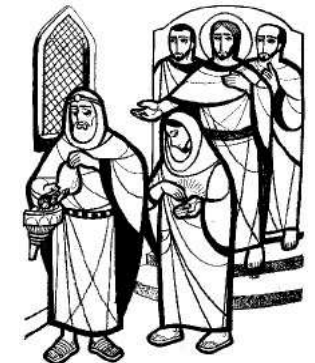
"This poor widow has put in more than all."