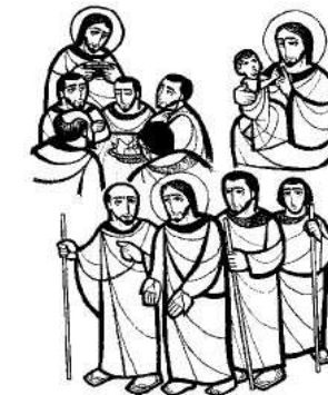
Jesus was teaching his disciples.