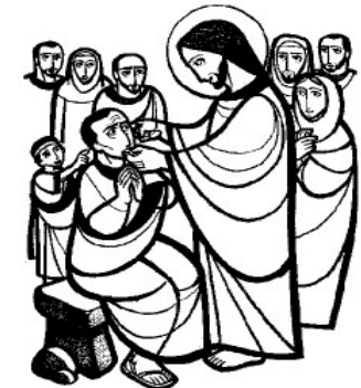
"He makes the deaf hear and the dumb speak."