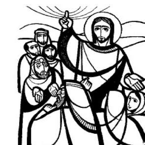
Jesus said, "I am the living bread that came down from heaven".