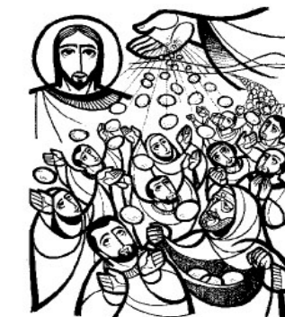
Jesus said, "I am the bread that came down from heaven".