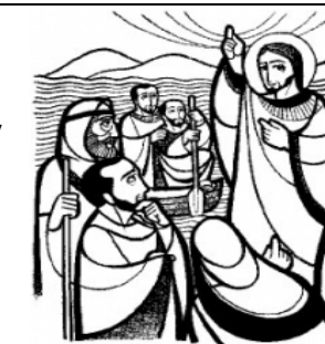
Jesus said, "My Father gives you the true bread from heaven".