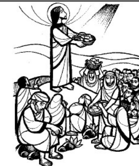
Jesus took the loaves, gave thanks, and distributed them.