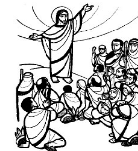
Jesus began to teach the crowd many things.