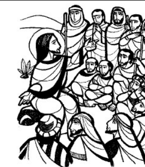
Jesus summoned the Twelve.