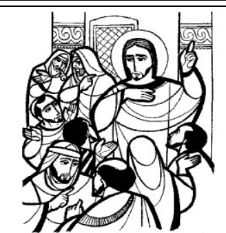
He began to teach in the synagogue, and many who heard him were astonished.