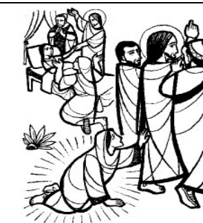
"If I but touch his clothes, I shall be cured." "Little girl, I say to you arise!"