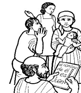
"He will be called John."