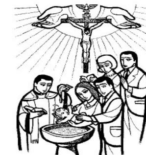
"Baptize them in the name of the Father and of the Son and of the Holy Spirit."