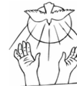
"Receive the Holy Spirit."