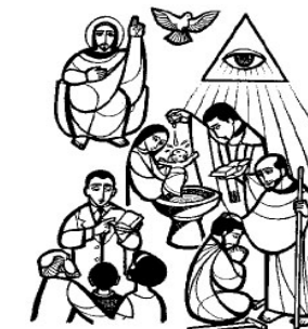
So I sent them into the world.

May 26/27 Pentecost Sunday HOSPITALITY USHERS READER SERVERS *EMHCS