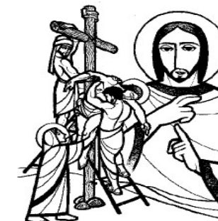
No one has greater love than this, to lay down one's life for one's friends.

May 16/17 Ascension of the Lord HOSPITALITY USHERS READER SERVERS *EMHCS MUSIC MINISTRY