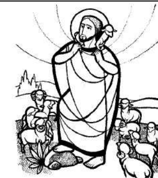
I am the good shepherd.