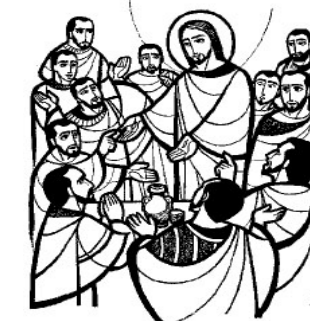
Look at my hands and my feet, that it is I myself