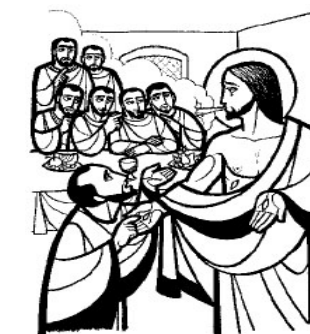
We have seen the Lord!