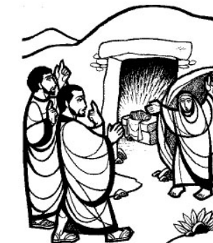
The tomb is empty, he is risen!