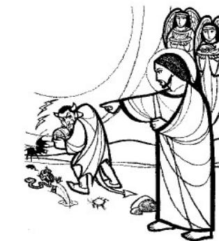
Jesus was tempted by Satan, and the angels looked after him

March 3/4 2 nd Sunday of Lent HOSPITALITY USHERS READER SERVERS *EMHCS