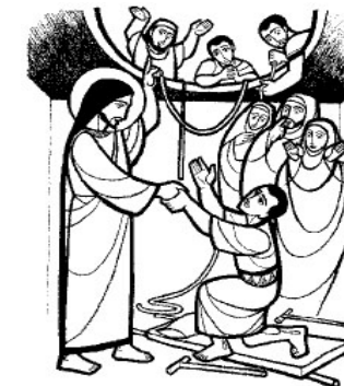
They opened the roof and let down the mat.

February 22 Ash Wednesday HOSPITALITY USHERS READER SERVERS *EMHCS MUSIC