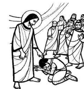
The leprosy left him at once and he was cured