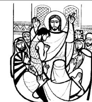
He taught them with authority